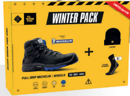
WINTER PACK FULL GRIP MICHELIN | WHEELS