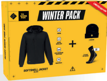
WINTER PACK SOFTSHELL JACKET | BLACK