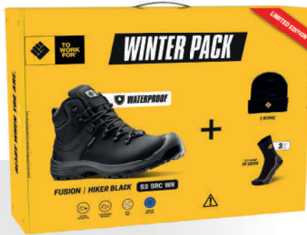
WINTER PACK FUSION | HIKER BLACK